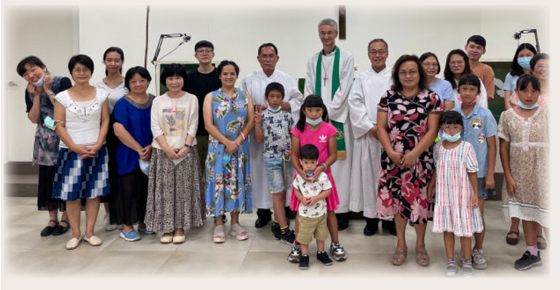
Church of the Holy Word members gathered in the Longshan location.

Later, due to the urban planning of the Hsinchu City Government, the original mission community (Qianjia Indigenous Settlement) was included in the planned location of the capital, so it was moved to the current location (the second floor of the Longshan Community Activity Center) for the gathering, except for the maintenance of late. In addition to the worship, morning worship and afternoon Vietnamese worship are added. There are three services on Sunday. Since the evangelistic mission of this mission is to insist on the teaching of the pure word (truth) of God, because