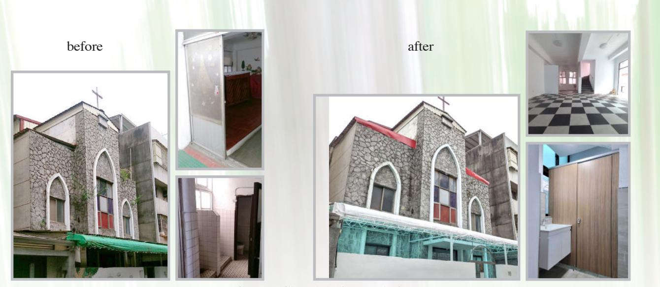
Canaan Church before and after

prayers and evening prayers are being held on Mondays and Fridays. In 2023, depending on the pastoral manpower of our church, we will develop weekly worship and service industry evangelism ministry.