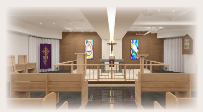
Church of the Holy Word future design drawing

God through his word created and established faith in Christ. We believe that "the grass withers, and the flower fades; but the Word of the Lord endures forever" (1 Peter 1:25).